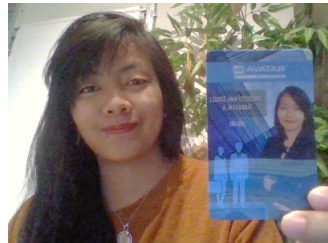
Candidate ID Card April 19, 2018 8:42:45 AM BNT