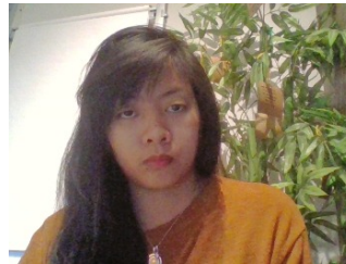
Un-announced Candidate Image Capture April 19, 2018 8:44:27 AM BNT