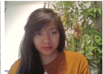
Un-announced Candidate Image Capture April 19, 2018 8:45:24 AM BNT