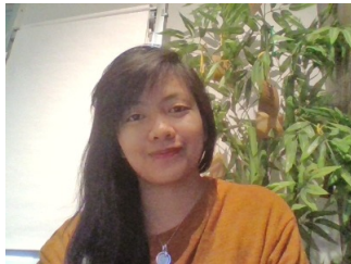
Candidate Image Capture April 19, 2018 8:40:25 AM BNT