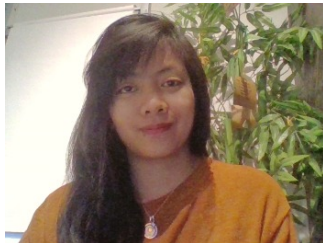
Candidate Image Capture April 19, 2018 8:46:42 AM BNT Timeout