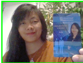
Candidate ID Card April 19, 2018 8:42:45 AM BNT, In-Test Photo