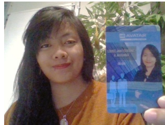
Candidate ID Card April 19, 2018 8:42:45 AM BNT