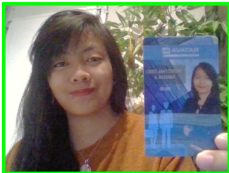
Candidate ID Card April 19, 2018 8:42:45 AM BNT, In-Test Photo