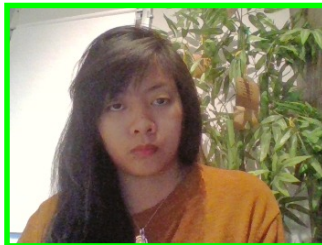
Un-announced Candidate Image Capture April 19, 2018 8:44:27 AM BNT, In-Test Photo