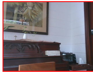
In-Test Error Detected (No Face Detected)